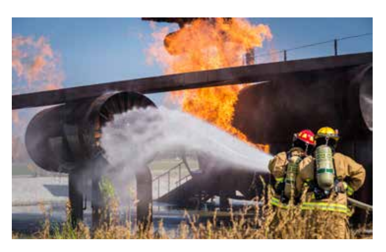
Firefighters assigned to the 139th Fire Emergency Services, Missouri Air National Guard, battle a simulated aircraft fire at Offutt Air Force Base, Neb., July 16, 2018. The civilians and airmen were conducting an aircraft live-fire exercise as part of their annual training.

The North Development Plan was a design contract in which the 139th updated their base master plan. This plan identified the order in which our facilities would be constructed on the north portion of the airfield. The work that was done with this design, which was completed in January of 2018, along with the future mission initiatives has helped to propel this effort to get the entire base relocated to the north end of the airfield.