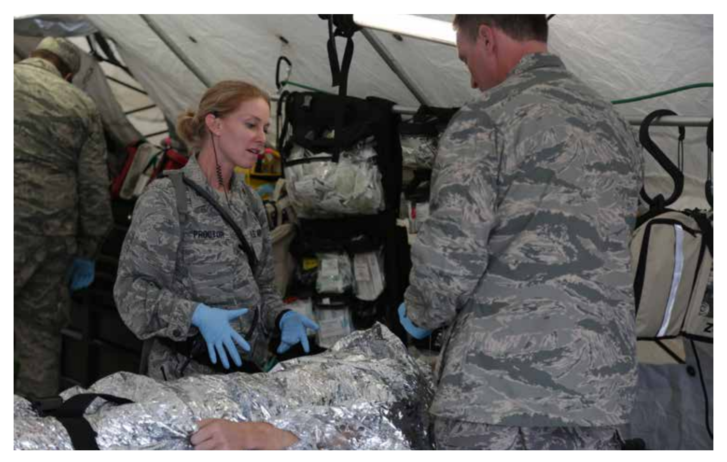
U.S. Air Force Maj. Allision Proctor examines a mock patient during a Homeland Response Force training exercise in Columbia, Mo., Oct 11, 2018.

group assisted in exercising and evaluating various operational and response capabilities, in addition to delivering public health and medical services to needy residents of south Texas. In total, 43,005 medical services were provided to 9,346 patients over the five-day event, including life-saving vaccinations, blood glucose screenings, school sports physicals, eye exams and dental exams.