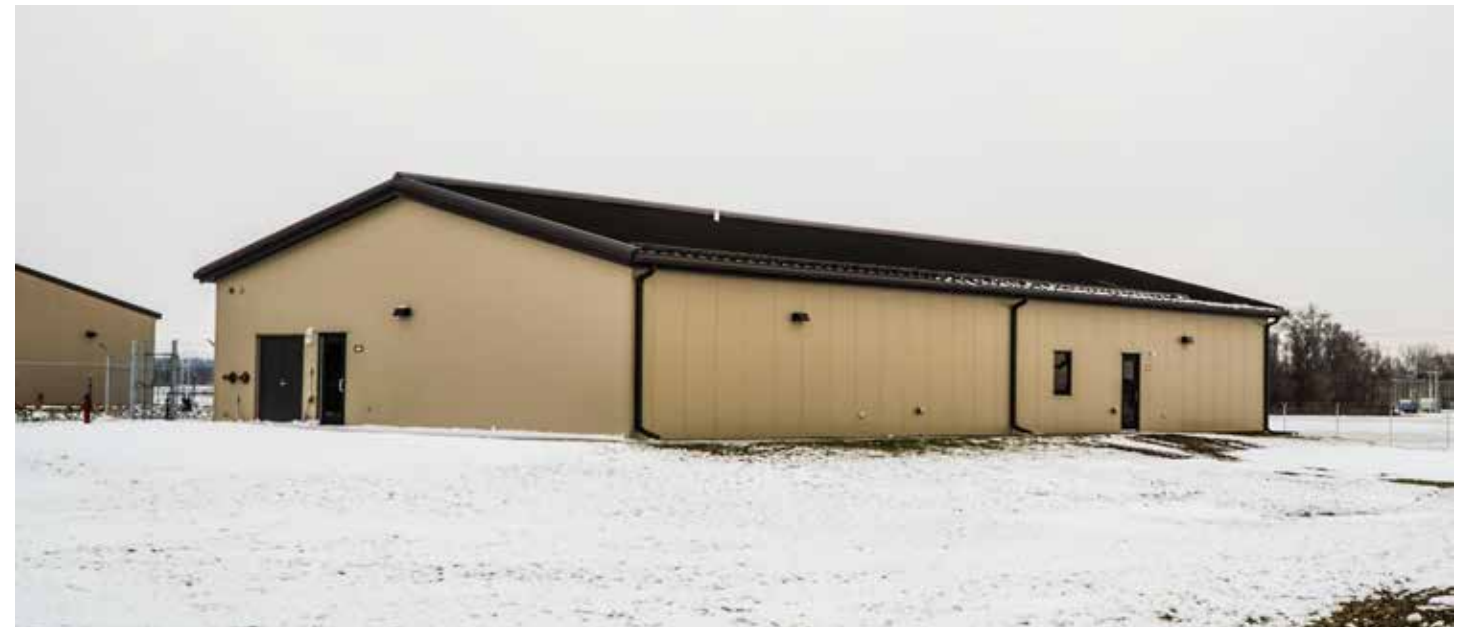
A new building for Detachment 1, 139th Medical Group, is near completion at Rosecrans. Det. 1 is responsible for the medical support of the Missouri National Guard's Homeland Response Force. The construction is part of a long term plan of moving the base north of its primary location.

degree was then broke down annually and based on 60% of the total enlisted personnel utilizing their benefits.