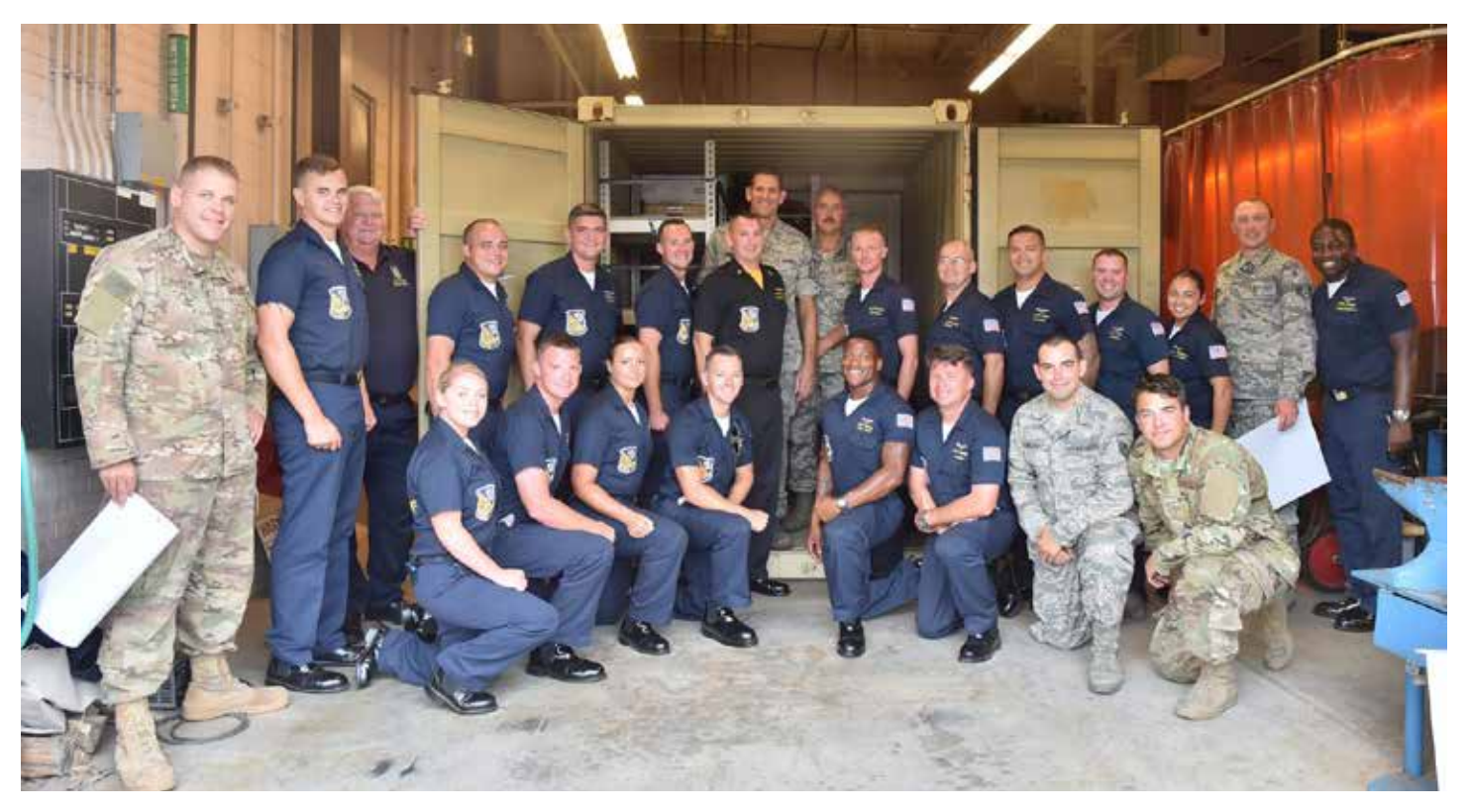
The Fabrication Flight showcased their capabilities at the 2018 Sound of Speed Airshow. The shop converted an ISU-90 into a deployable consolidated tool kit (CTK) for the Blue Angels.

We deployed four C-130 aircraft, along with maintenance teams and leadership to Fort Huachuca, Ariz. to support a seven day Operations and Maintenance Group AEF training event. The team provided mission ready aircraft to support a total of 1,899 operational