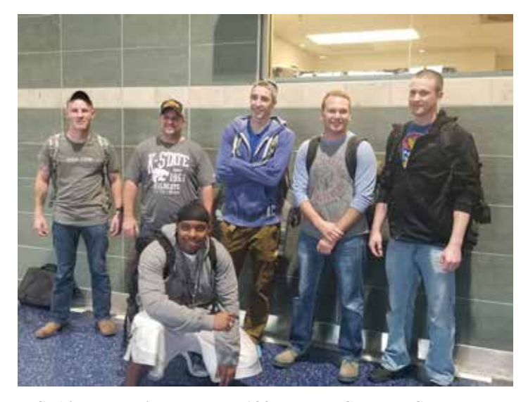
U.S. Airmen assigned to the 139th Force Support Squadrondepart for a 6-month deployment in support of contingency operations.

Our deployment function processed all 326 wing members out the door over a three month period and then welcomed them home over 35 days, hosting 25 receptions; to include seven from FSS. Furthermore, FSS processed 24 passports and 82 promotions, 1,398 ID cards, and 117 enlistments.