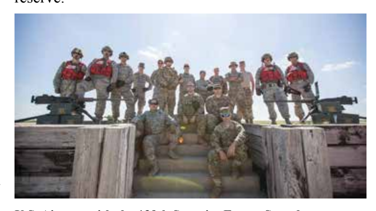
U.S. Airmen with the 139th Security Forces Squadron pose for a photo during training with a M2 Browning Machine Gun at Fort Riley, Kan., September 8, 2018.

we project power. At the heart of this no-fail mission is the elite defender who must be the best in the world at 21st century integrated base defense." Security Forces career field leadership produced a comprehensive plan aimed at revitalizing the career field. Significant changes are on the horizon for FY19. These changes include a Security Force specific PT test, the new M18 service pistol, new standardized gear, tier level training, proficiency firing requirements, and defender basic military training flights, to name a few of the changes heading our way. The 139th SFS is prepared and ready to accept these new challenges not only in our own squadron, but for our career field. We stand ready to be the example all other Security Forces Squadron's model themselves after, whether active duty, guard, or reserve.