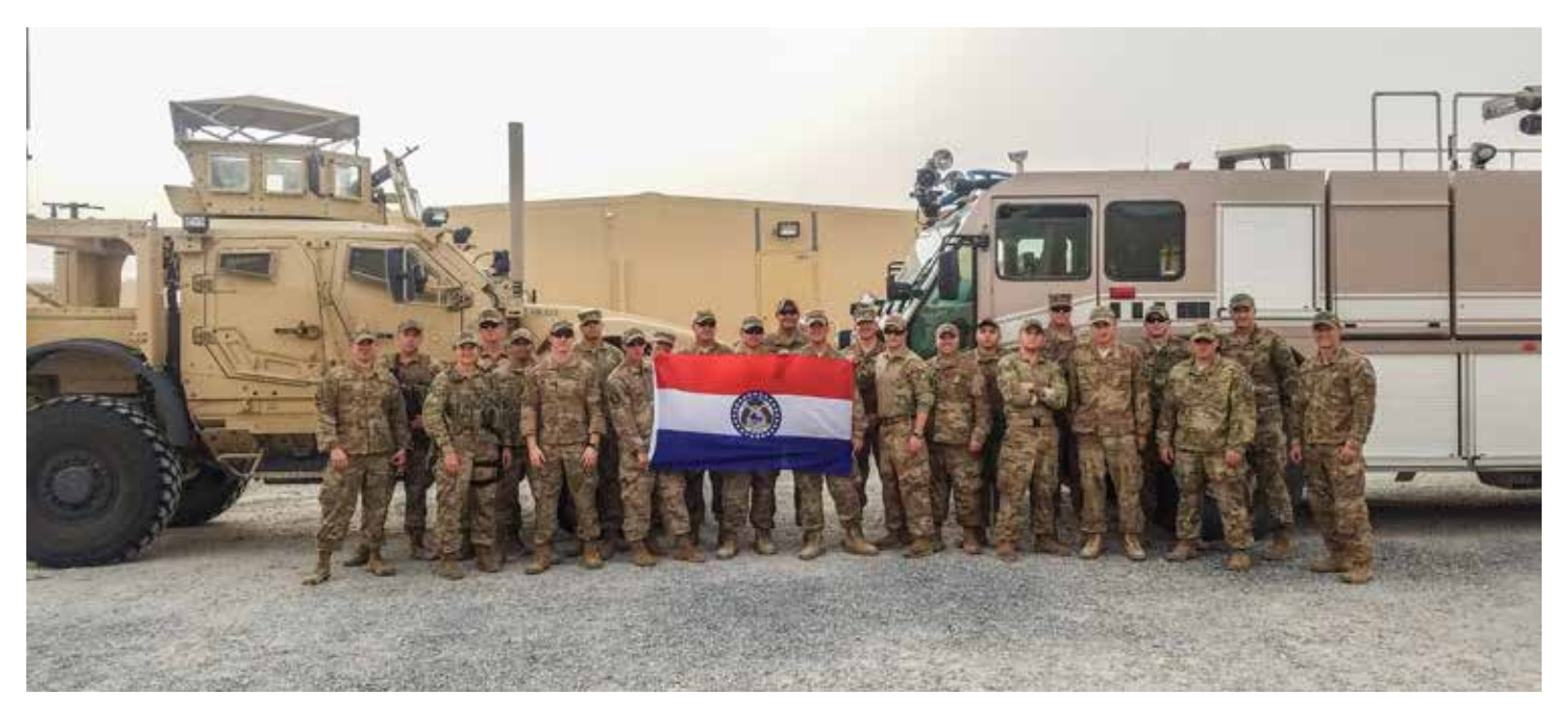
U.S. Airmen assigned to the 139th Security Forces Squadron, Missouri Air National Guard pose for a group photo while deployed to Al Jabbar Air Base, Kuwait.

arms. The 139th SFS combat arms shop is also tasked with the maintenance of all our squadron's weapon systems. This results in a heavy work load for a depleted personnel shop. Each member of the combat arms program answered the call and conducted 75 training classes, more than double the year prior. Their hard work resulted in 638 personnel trained and qualified during FY18, which was instrumental in insuring our squadron and wing mission success.