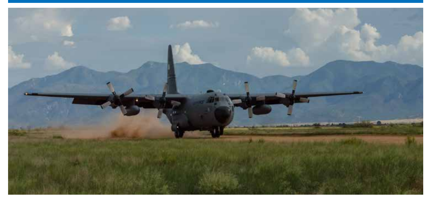
A U.S. Air Force C-130H Hercules lands on Hubbard Landing Zone at Fort Huachuca, Ariz., during a mobility flying course conducted by the Advanced Airlift Tactics Training Center.