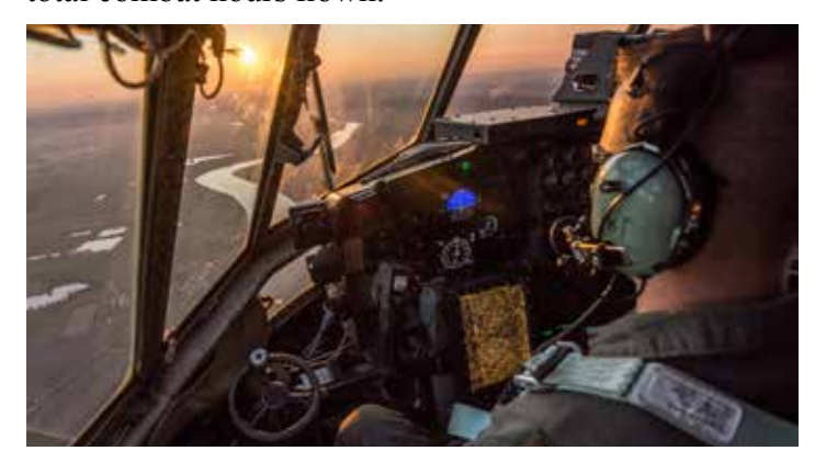
U.S. Air Force Maj. Greg Hafley, a C-130 Hercules aircraft pilot, participates in a personnel drop during Saber Junction 18 above Germany, Sept. 19, 2018.

During AEF operations, the unit broke the single month flying hours record with nearly 1,000 hours flown in the month of March. This record had been held for a decade prior and the 139 OG accomplished this with one tail less than the prior unit. Air crews also averaged 20 sorties per day and accumulated a staggering 3,604 total combat hours flown.