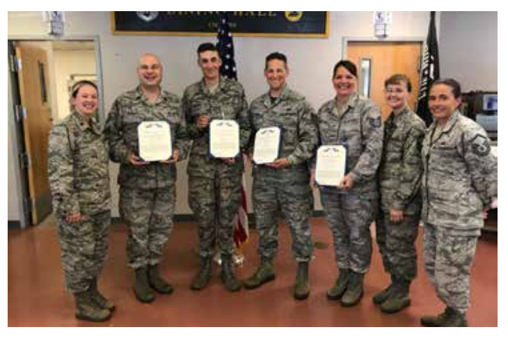
139th leadership presents Airmen with the 131st BW, Air Force Commendation Medals for their selfless support during deployment operations.

office next year. The relocation of the testing office has allowed for a larger room with nine testing computers available. 139th Force Development continues leading ANG metrics in resourcing and executing Mission Essential Skills Training Days. Additionally, NGB report cards recently recognized our FDO "Excellence" in shipping members to basic and technical schools. This has been a recent change in virtually shipping