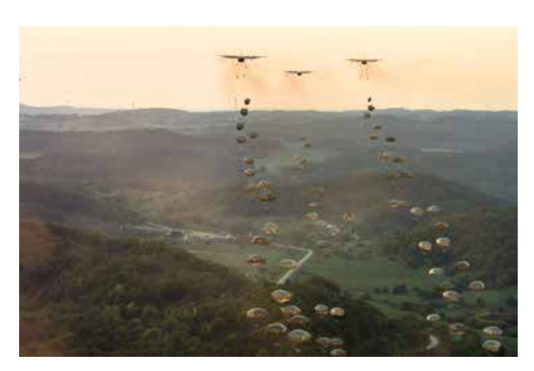
U.S. Army soldiers from the 173rd Airborne Brigade, as well as soldiers from various allied nations, parachute from U.S. Air Force C-130 aircraft onto a drop zone in Germany, Sept. 19, 2018.

Throughout all of this change, the operations group continued to excel and set the "Gold Standard" for tactical airlift and air traffic control in the Air National Guard.