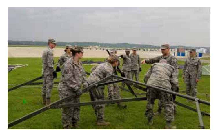
U.S. Airmen with the 139th Force Support Squadron set up tents during annual training.

One more innovation success was the first ever Memorandum of Agreement with the 131st FSS to assist Services in providing meals and proctoring physical fitness assessments, allowing the Fatality Search and Recovery Team focus to remain on preparing for this autumns ExEval. The FSRT team is graded on criteria for all functional areas of responsibility to include set-up in a contaminated environment and search and