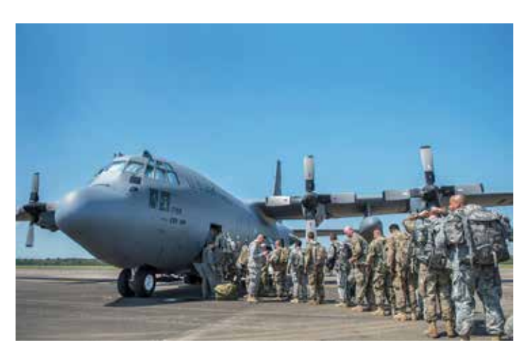
Soldiers and Airmen from the Louisiana National Guard board a C-130 aircraft from the 180th Airlift Squadron, Missouri Air National Guard for transport to Puerto Rico at Naval Air Station Joint Reserve Base New Orleans on Sept. 30, 2017. The Louisiana National Guard is sending more than 300 Soldiers and Airmen to support recovery efforts following Hurricanes Irma and Maria.

During this readiness period ARMS also supported hurricane relief, Saber Junction, AEF along with local flying operations. Maintained aircrew proficiency as primary Comsec Responsible Officers for the entire group, AATTC and WIC missions. The efforts of ARMS provided 850 sorties, 1968 total hours, 86 AO's, 2210 Logs, and 1,105 full steps for the year.