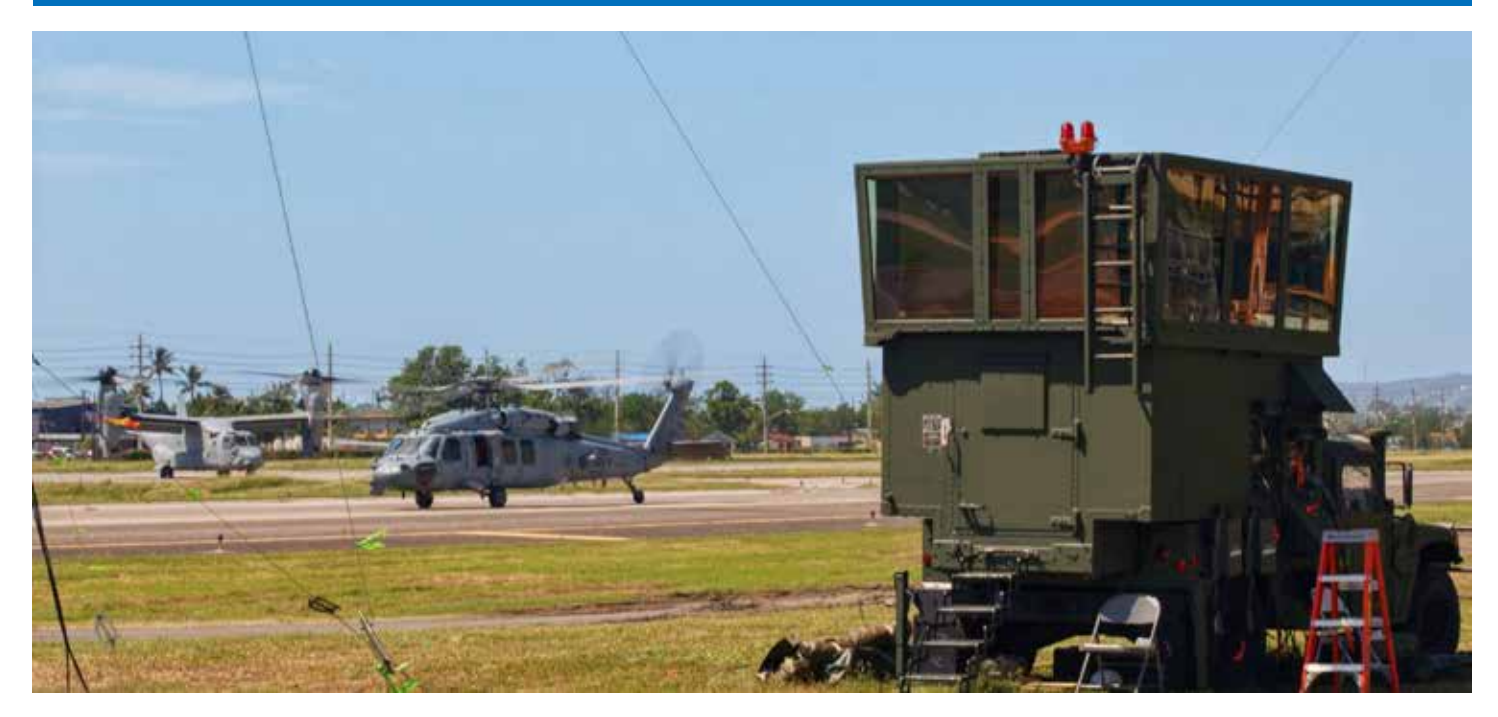
A mobile air traffic control tower assigned to the 241st Airt Traffic Control Squadron sits at Mercedita Airport in Ponce, Puerto Rico, on Oct. 30, 2017. The squadron was activated to assist with hurricane relief efforts.

Over the course of FY 18, the 241st ATCS faced numerous challenges on multiple fronts. Supporting national policy, safeguarding territorial citizens from natural disasters or enabling the operational testing and evaluation (OT&E) of a new deployable air traffic control approach landing systems are just a few. As always, even with nearly 50 percent of the squadrons members deployed, the energies of the men and women of this organization met each one of these tests, overcame any obstacles placed before them, and successfully carried out the mission.