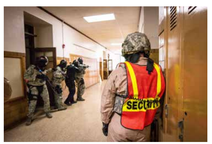
U.S. Airmen with the 139th Security Forces Squadron, Missouri Air National Guard, conduct small team tactics training at an abandoned elementary school, in St. Joseph, Mo., June 2, 2018. The training utilizes simunition rounds, which are paint-based rounds that provide a realistic training environment.

The motivation and dedication from the 139th Security Forces Squadron remained steadfast upon the return of our deployed members. Immediately following their return was the Sound of Speed Air Show. Air show operations requires all "hands on deck" to ensure the safety of the attendees, performers, and assets on our installation. Our defenders answered the